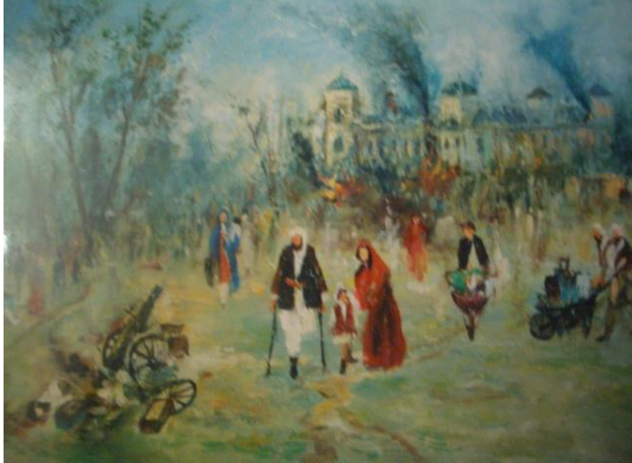
War in Darlaman Kabul Oil color on canvas paper, 9 x 12 in.