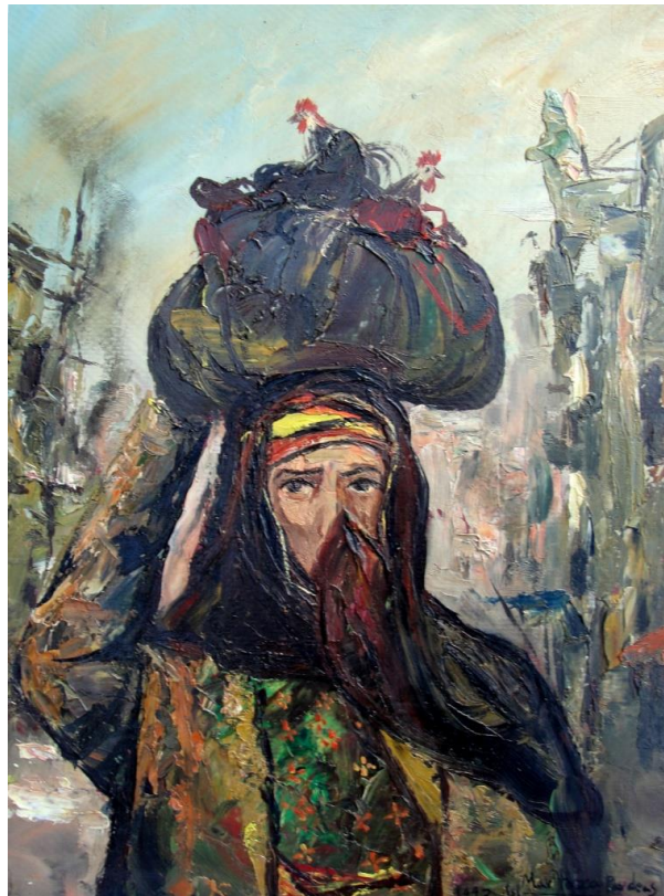
Escape from War