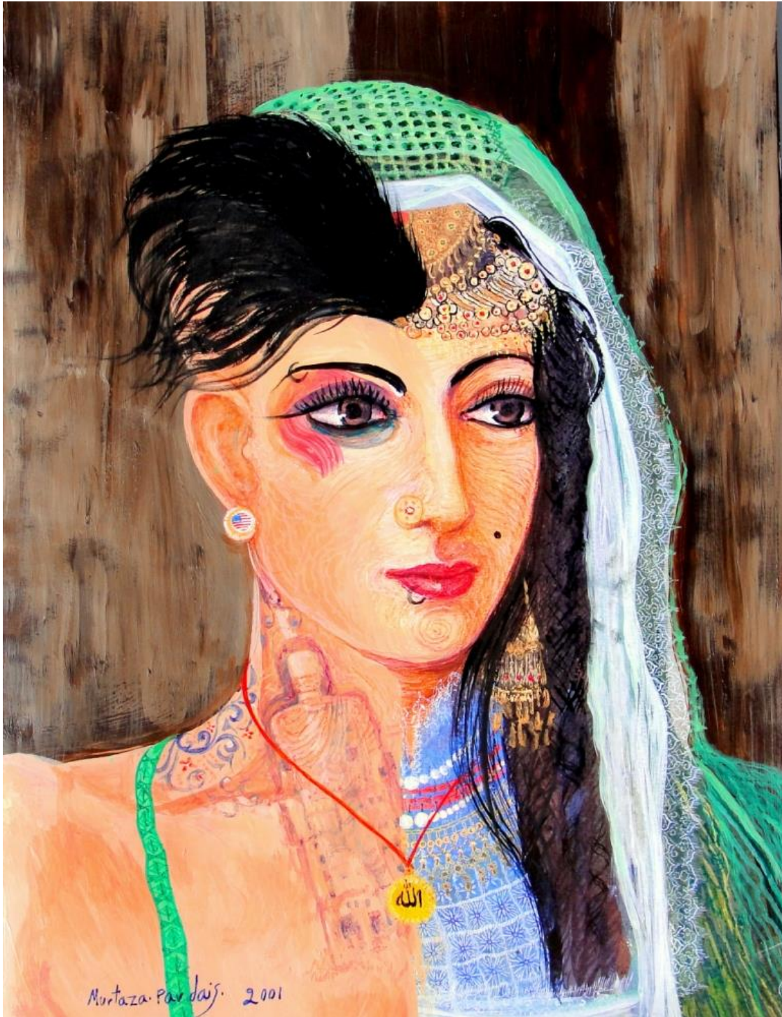
Yesterday/Today? Afghan Girl Between Two Cultures © Murtaza Pardais Watercolor on paper, 16 x 20 in.